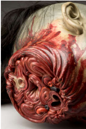
Memento mori c.1500s